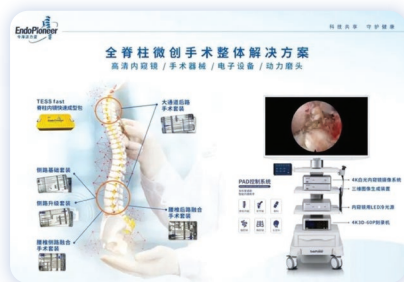
Spinal Minimally Invasive Surgical System

On 17 November 2024, we successfully held a high-level training course on endoscopic spine surgery at the Tong Ren Hospital of Shanghai Jiao Tong University School of Medicine (上海交通大学醫學院附屬同仁醫院). Notably, the training featured advanced equipment from our subsidiary, Shanghai Jinhai Pioneer Medical Technology Co., Ltd. 35 (" Jinhai Pioneer ") (上海今海派力亞醫療科技有限公司), including its spinal minimally invasive surgical system. This system incorporates endoscopic tools and equipment, complemented by our state-of-the-art imaging and display systems. The combination of high-quality surgical instruments and high-definition imaging demonstrated exceptional effectiveness during the procedures. The advancement of endoscopic spine technology relies on continuous learning and collaboration. With this in mind, Jinhai Pioneer has expressed its intention to continue organising high-level academic seminars in the future. Through ongoing technological innovation and service enhancements, we aim to help equip young doctors with advanced skills, improve clinical treatment standards, and drive the growth and development of the spinal technology market.