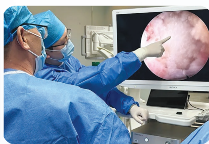
High-level Training Course on Endoscopic Spine Surgery